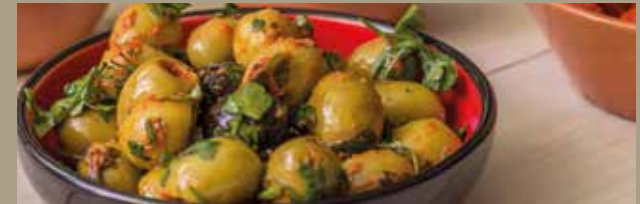
NEW Mediterranean Tapas Restaurant for April 2015