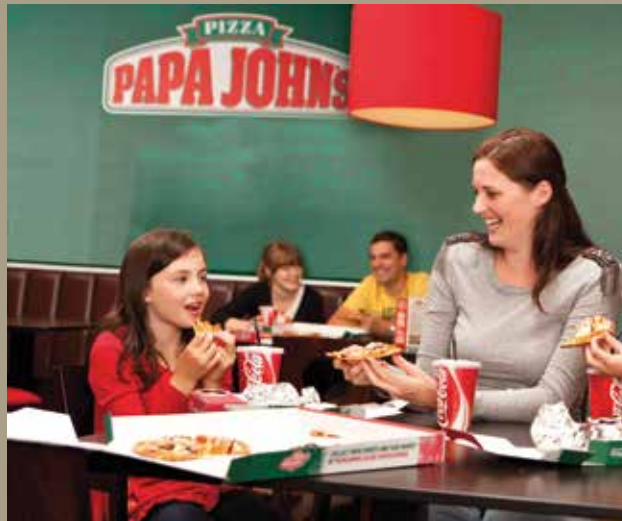
Papa John's Pizza Store & Takeaway