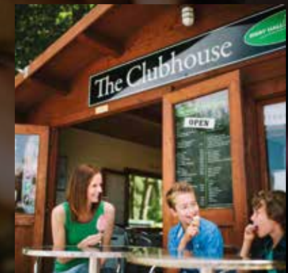
The Island Clubhouse