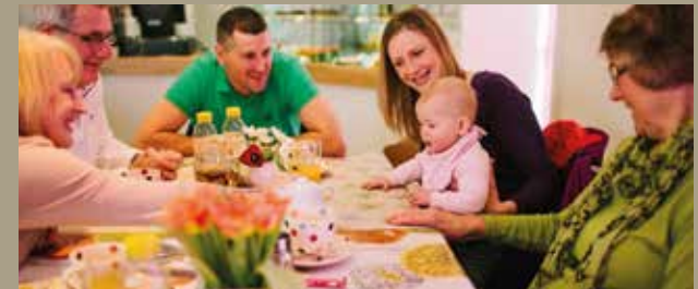
The Lavender Tearoom