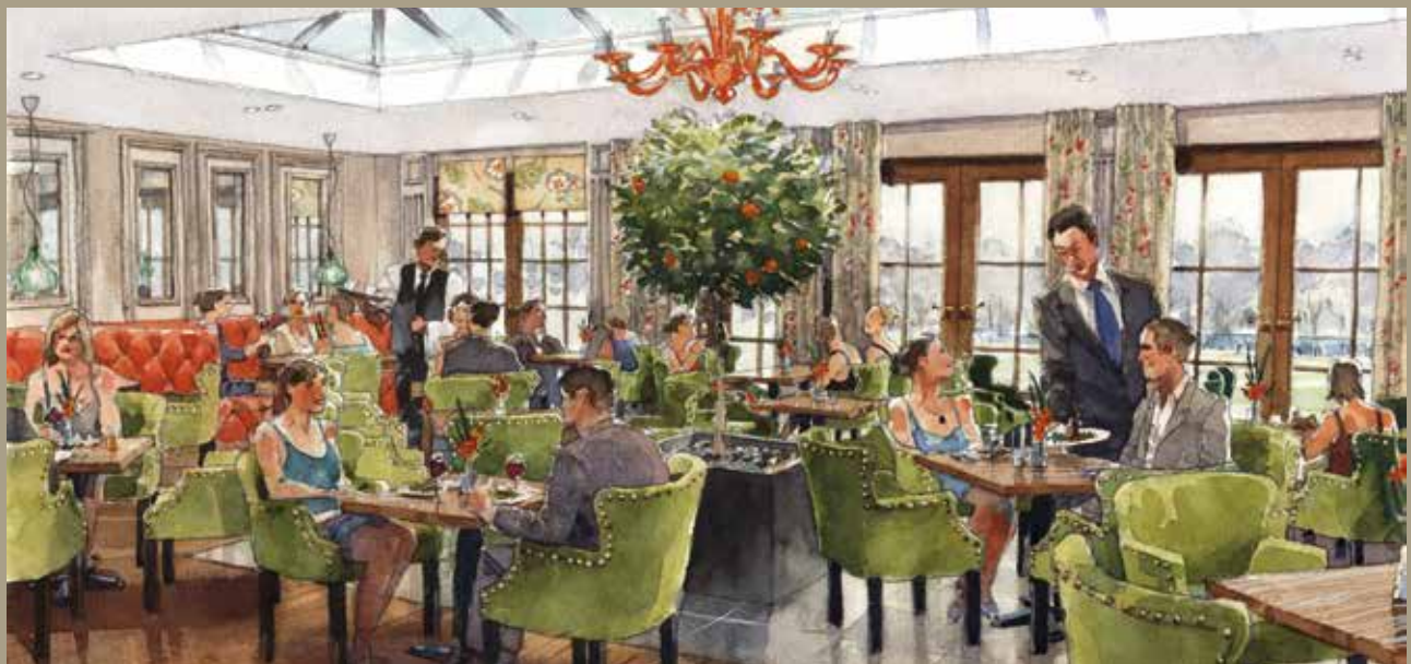
The Orangery at The Spa Hotel (Artist Impression)