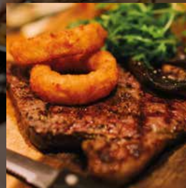
The Bar & Grill