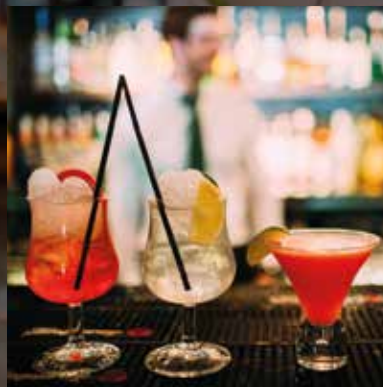
The Cocktail Bar

Of course, just because you have your own kitchen doesn't mean you can't savour the tastes of Ribby Hall Village. Not only are our chefs trained to the highest standard, some of our produce is also grown right here in The Village Garden. From the sophisticated Restaurant to the fun-filled Bar & Grill, there's something to suit all tastes!